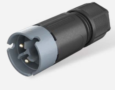
Figure in original size. Diameter: 14.9 mm Length: approx. 40 mm